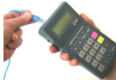
ASPTraq Ethernet Terminal

Perhaps not all your Terminals need to be portable. ASP's rugged low cost wired ASPTraq Ethernet Terminal is RFolution! compatible and can be intermixed with Portable RF Terminals. ASPTraq has a footprint of only 95mm x 190mm, a sealed keypad and LCD Display, and no dust attracting cooling fan. Combined with an ASP Barcode Scanner it makes a great tracking Terminal for industry.