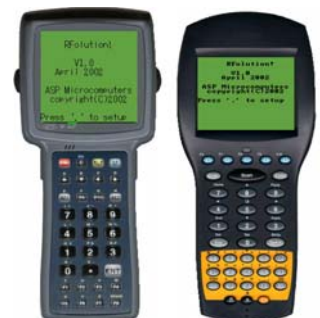
PC screen Simulators

Because VBScript is a Microsoft language, you have full interoperability with other MS applications, using standards such as ODBC and ADO. We're also included a number of simple and more complex demonstration Scripts that you can run immediately on the Simulators, and modify to your needs. These include database applications, and examples using Excel as a display and print engine.